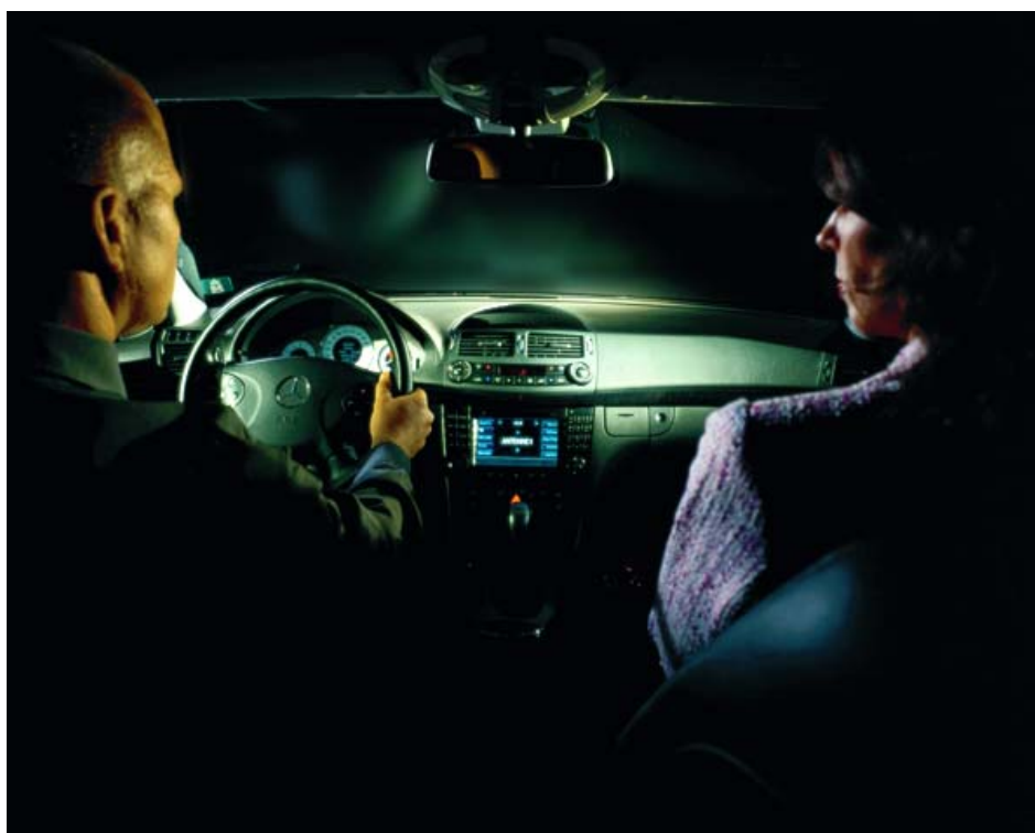
The data behind the display fascia must be clearly visible. Before its costly coating process it is pre-treated with plasma.

The Openair system is characterized by a threefold action: It brings about microfine cleaning of the surfaces of metals, plastics, ceramics and glass on one side. On the other it highly activates the surface by selective oxidation processes. As a result, surface energies over 72 \text{ mJ/m}^2 become possible with many plastics materials. At the same time the surface is discharged which results in a great extension of the system's application possibilities. The nozzles are designed for the most diverse geometries. They are robot compatible without restriction and can be integrated into an