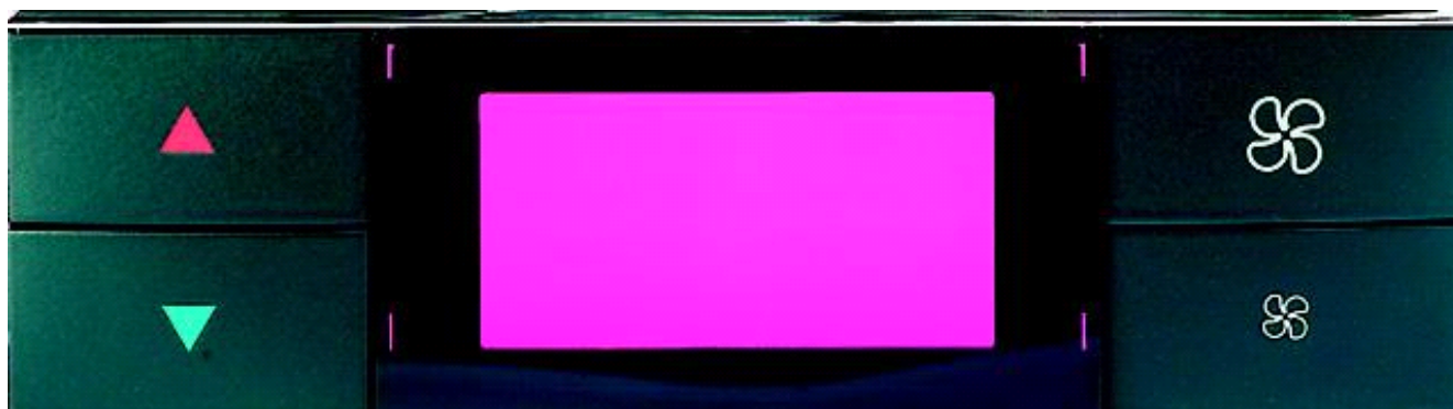
Colored and scratch-proof coated display fascia for air conditioning systems. Treating the panes with plasma at atmospheric pressure leads to impeccable optics and long term stable adhesion of the coating.